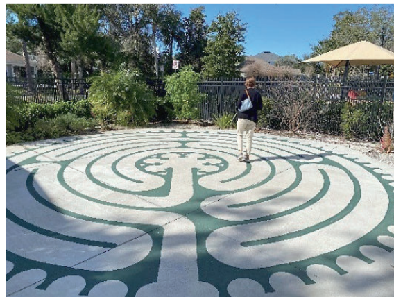
Our New Labyrinth