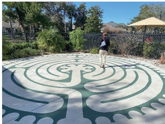
Our New Labyrinth